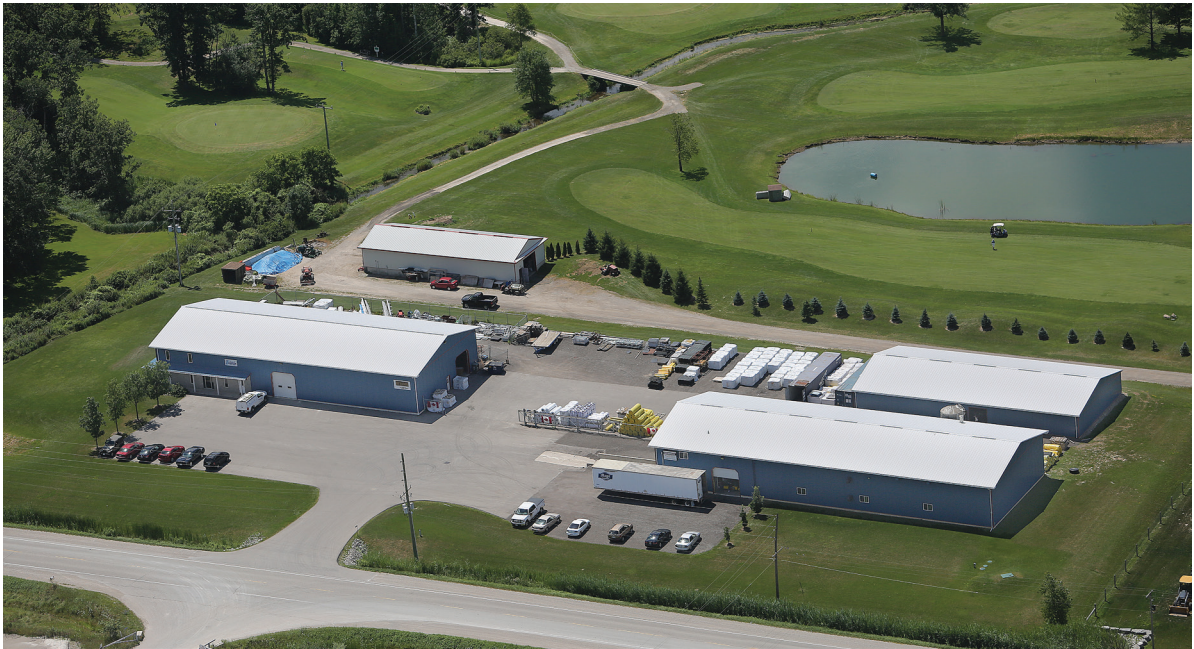
Promat Headquarters, Woodstock, Ontario, Canada